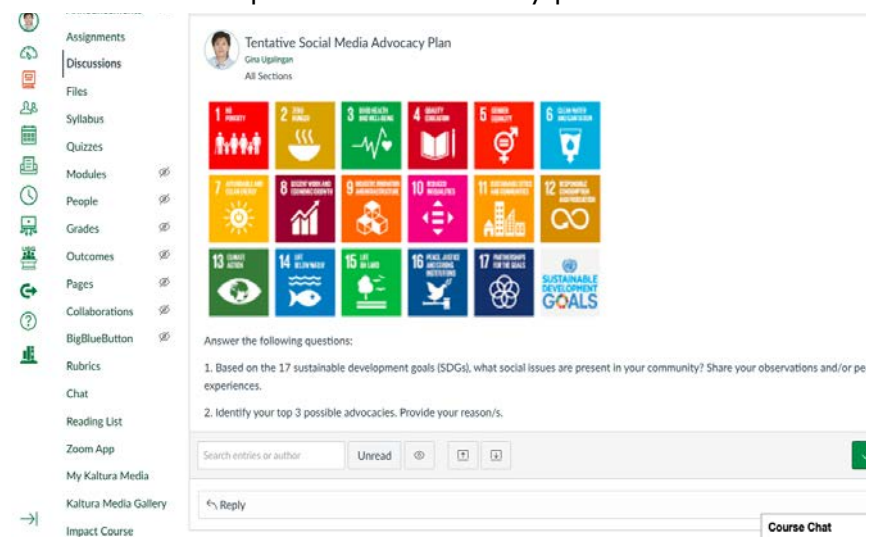
Figure 1. Canvas discussion thread

a. The students are tasked to participate in a forum online by posting on the Canvas course discussion board. In terms of input, students are expected to identify the SDGs covered in the presentations and relate these inputs to their own observations in their respective communities. Figure 1 shows a sample of a Canvas discussion thread in which the teacher poses questions related to observations of students concerning the SDGs. Further, this solicits inputs from the class on selected advocacy that students intend to work on as part of their advocacy presentation.