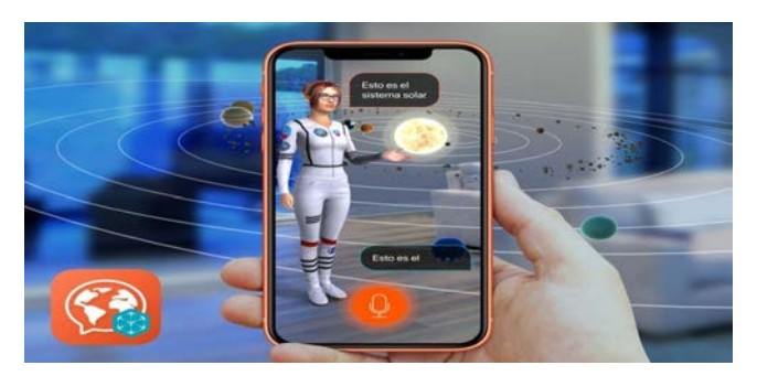
Figure 5: Mondly