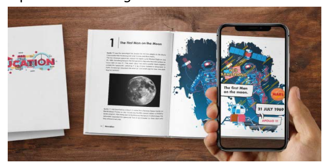
Figure 4: AR Picture Book

Hung et al. (2017) investigated the effectiveness of student training using three kinds of learning resources: a picture book, direct interaction, and an AR graphic book. They discovered that when compared to the other two groups, students who used the AR learning resources were the most satisfied and engaged. Furthermore, Cheng & Tsai (2016) investigated parents' perspectives on AR instruction to better understand how both children and their parents react. Parents in child-parent pair communicative groups and groups of children have generally positive viewpoints about AR classroom teaching, such as viewing AR learning as increasing motivation and supporting a deep understanding.