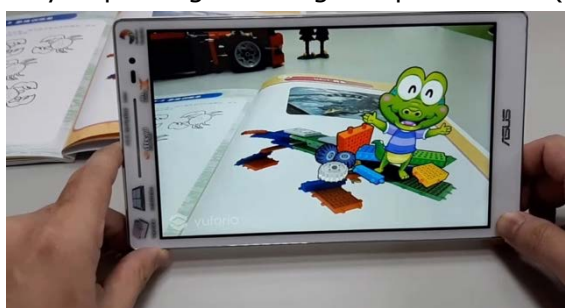
Figure 1: Mobile AR with Aurasma

Augmented reality with Aurasma creates 3D visual effects with audio and motion. Yang & Mei (2018) evaluated students' views and experiences with a mobile augmented reality-based stroke-by-stroke animation guide for language learning and discovered that they had positive perceptions. The findings indicate that Aurasma enhanced efficient vocabulary acquisition by allowing learners to experience visual effects for vocabulary items, thereby improving meaning comprehension (Redondo et al., 2020).