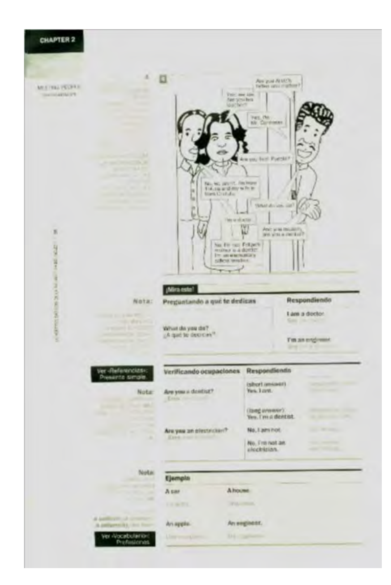
Figure 1: Page from the Libro de Apoyo showing the translation of the dialogues.