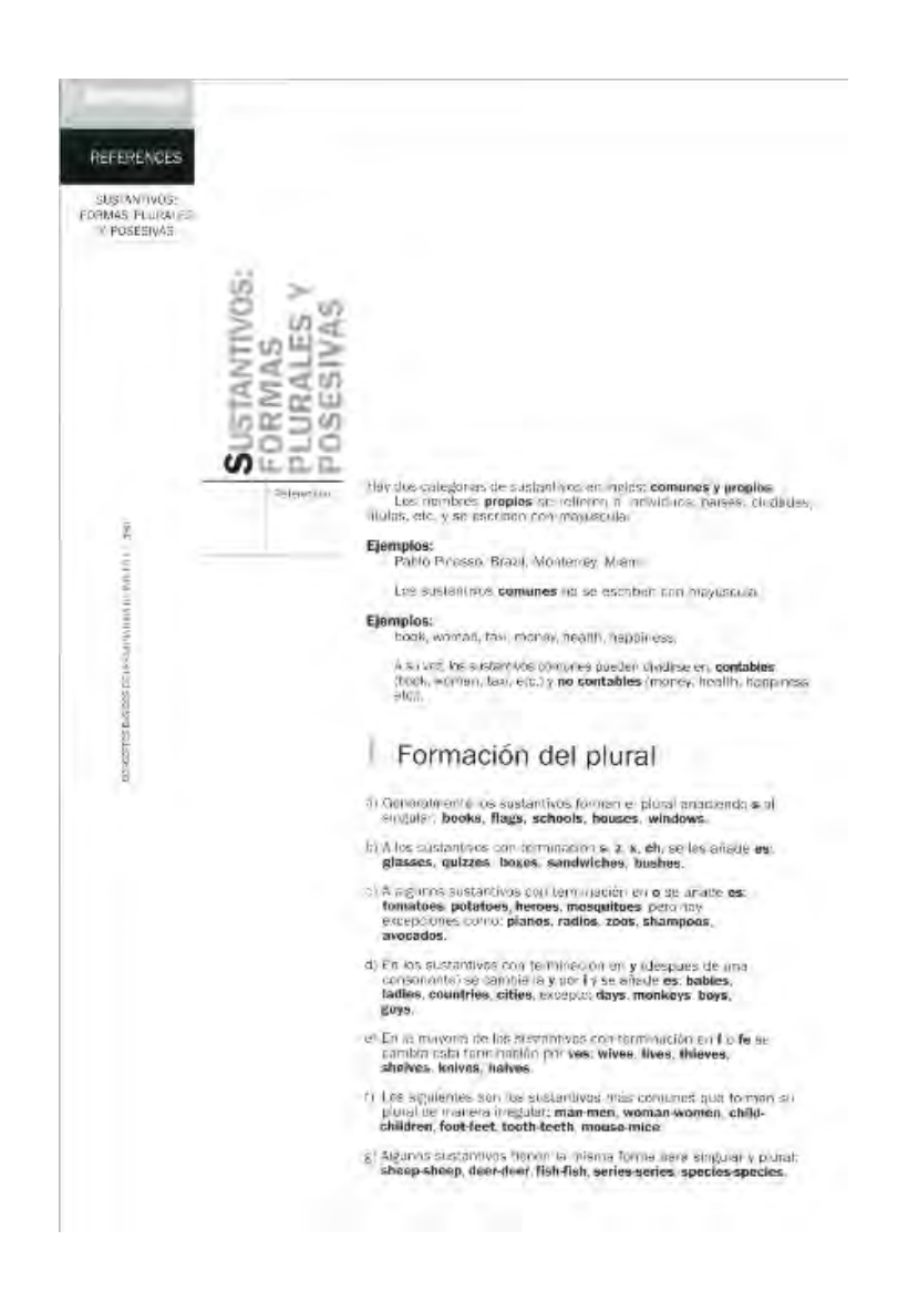
Figure 2: Page from the Libro de Apoyo showing additional explanations and materials.

Gibran and Edgar took on the task of preparing the listening materials to accompany the Teacher's Guide. They recruited volunteers amongst their compañeros in the licenciatura program as well as foreign students studying Spanish at the school to make the recordings. They had decided that it would be good to include a mix of both foreign and Mexican accents. Gibran used CoolEdit software to mix and format them on the computer, add ambient music and transitions, and finally burn the master CDs. The final product was an