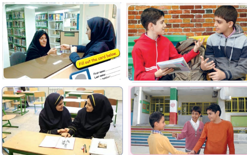
Note. Reprinted from Textbook 1, Page 10, 12, and 18; Textbook 2, Page 26 (From left to right, respectively).