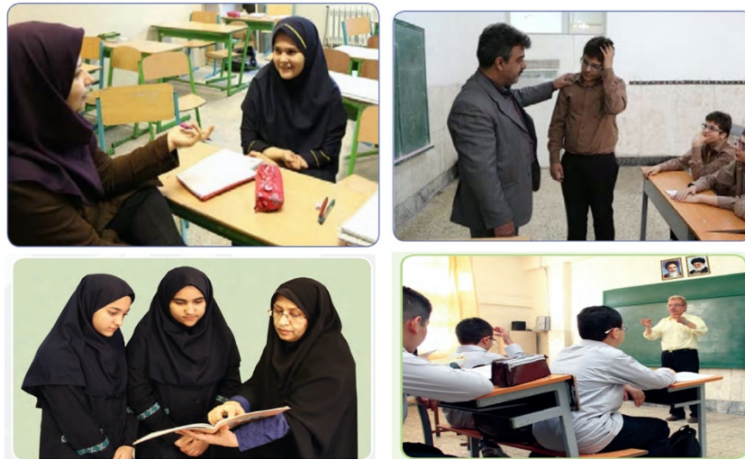
Note. Reprinted from Textbook 1, Page 6 and 30; Textbook 2, Page 18 and 34 (From left to right, respectively).

was higher than their male counterparts. This might be suggestive of a common belief in Iran that teaching is a suitable job for females. Additionally, the portrayal of 'Teacher-Student' as the leading relation in the textbooks may create the conception in students that English is a school subject, not a means of establishing communication with the world (Joo et al., 2020; Rao, 2019). Figure 2 shows some of the pictures assigned to the teacher-student conversations in the textbooks.